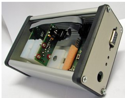
Fig. 3. Close-up of the UV detector based on LED technology.

tion devices, photosynthesis in plants, phototherapy, UV curing, etc. ). Recently, the wavelengths attained with LEDs reached 250 nm, and so opens up new possibilities in detection systems for HPLC [3] and capillary electrophoresis. [4–7]