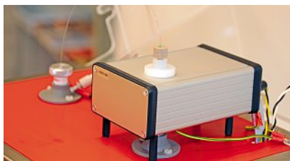
Fig. 2. Detail view of the UV detector based on LED technology.