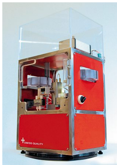
Fig. 1. Picture of the newly developed low-cost analytical capillary electrophoresis device.

This new CE device (Fig. 1) is dedicated to conventional quality control of drug material (active principal ingredient, API) and drugs products (pharmaceutical formulations). CE should be successfully implemented in routine analysis due to its short analysis